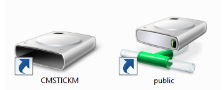
Figure 1. Sample of LNKs used by the threat actor

and execute from a compromised device an MSI package containing a malicious library.